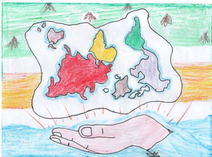
Bethel: Year 5