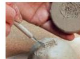
slip and score