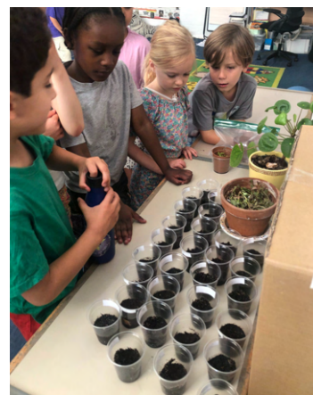
Class patiently waiting for bulbs