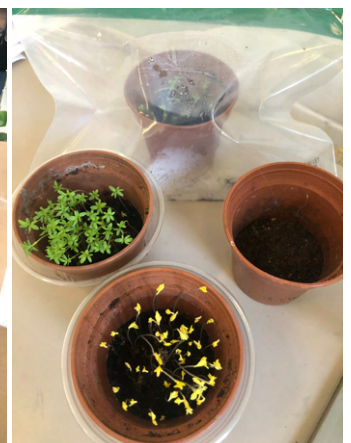
Experiment on good conditions