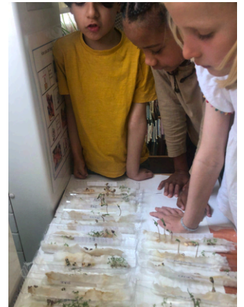
Children observing growth