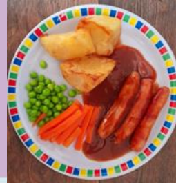
Vegetarian sausage with Roast Potatoes and Gravy