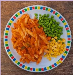
Tomato and Lentil Pasta