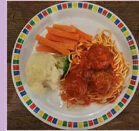
NEW veggie balls & Spaghetti