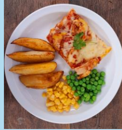
BBQ Chicken Pizza With Salads