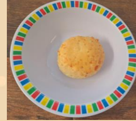
Savoury Cheese Scone