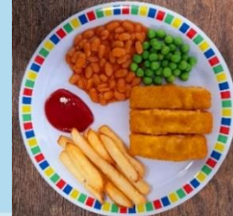
Salmon or Pollock Fish Fingers with Chips & Tomato Sauce