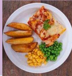
cheese & Tomato pizza with salads